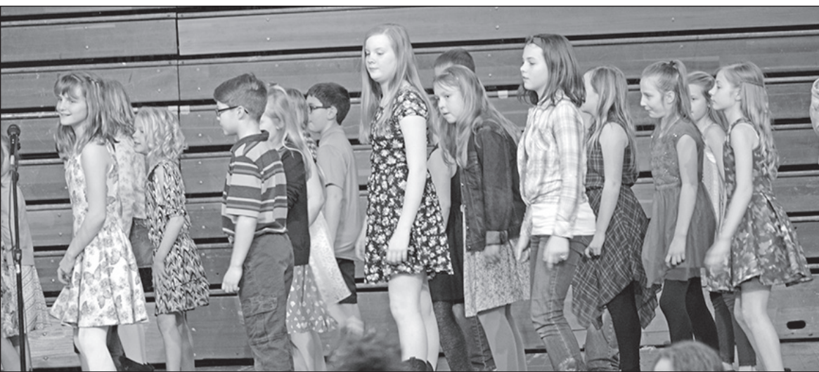
The students entered to "Footloose." They performed a variety of Broadway songs that they helped to choose. Songs included: "Tomorrow" and "Hard Knock Life" from Annie; "My New Philosophy" from You're a Good Man Charlie Brown; "See You Again" from Furious 7; "The Schyuler Sisters" and "Guns and Ships" from Hamilton: An American Musical; "Cups" from Pitch Perfect and "Getcha Head in the Game" from High School Musical. They then added dance to the program with "Electric Slide/Boogie" and "Cupid Shuffle" and finished with the grand finale/sing along "We're all in this Together" from High School Musical. The words to the last song were in the programs so that the audience could sing along with the students. During the dance portion, some of the students remained on stage and danced, and the rest moved down to the floor, where the audience was invited to join them.