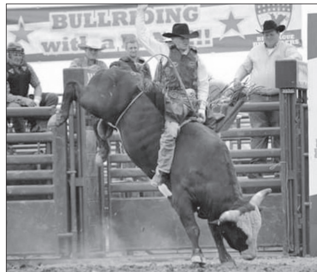
Big League Bullriders