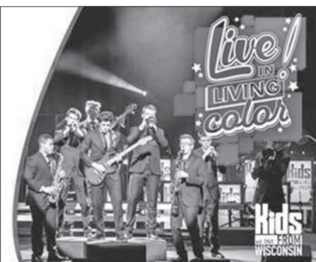
Kids from Wisconsin

For more details, go online to www.rockcounty4h-fair.com .