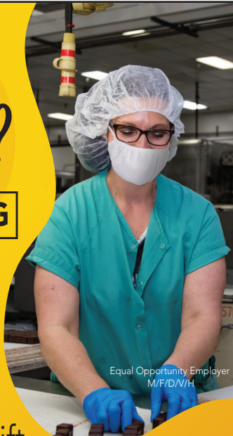
Equal Opportunity Employer M/F/D/V/H