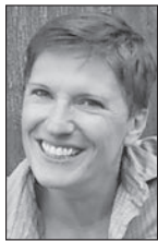
By ERICA ROTH Contributor

Have you seen the new Green County website? It is up and running and is extremely user-friendly. If you type in the old web address it will direct you to the new one, which is www.wi-greencounty.com . There are more features on the new website which makes navigating the site and finding what you are looking for much easier. Please check it out.