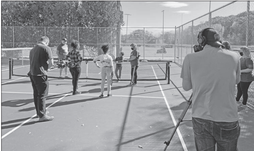
The "Discover Wisconsin" crew gets a try at pickleball during filming for the show's Janesville episode at Riverside Park.

For more information, go online to discoverwisconsin.com.