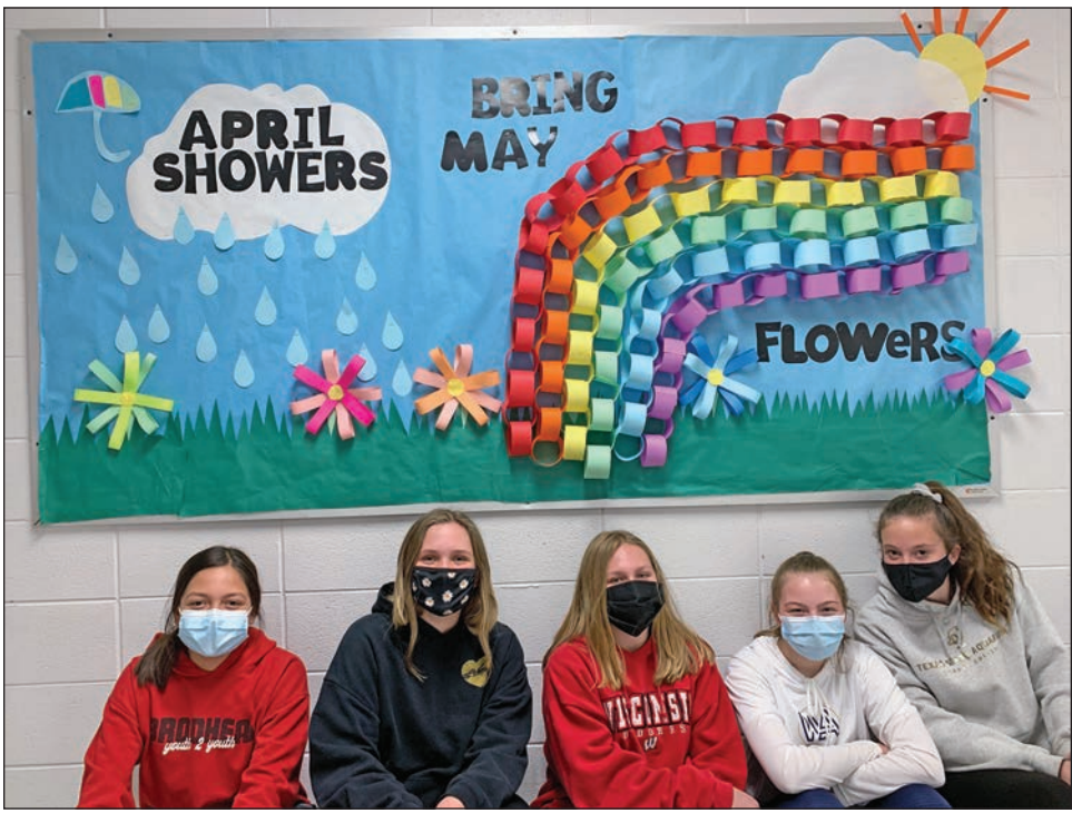
Spring is in the air at Brodhead Middle School, as two crews of seventh-grade TOOL members enlisted some help to brighten up hallway bulletin boards at the school.