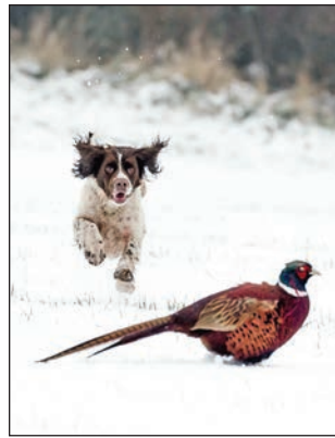
Brodhead Independent-Register

The Wisconsin Department of Natural Resources will stock pheasant at 25 state properties in central and southern Wisconsin during the week of Dec. 20, to increase hunting opportunities throughout the holiday season.