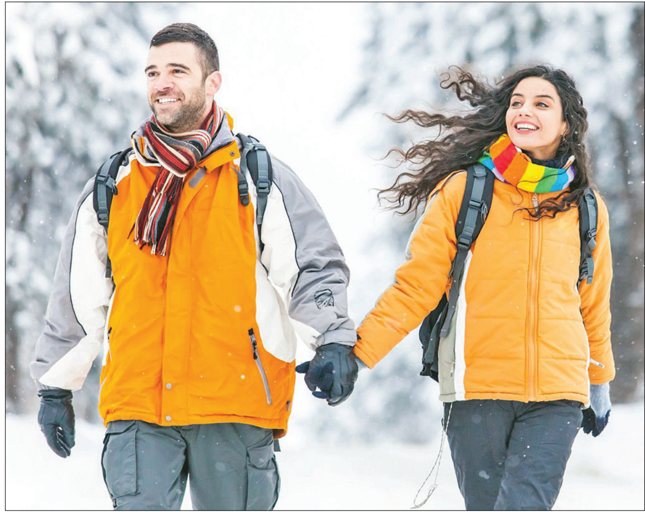
Join the thousands of people across the country to kick off the new year with a First Day Hike at a Wisconsin State Park.