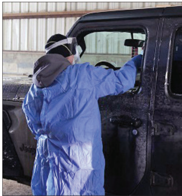
Left: Citizen Soldiers and Airmen from the Wisconsin National Guard collect specimens for COVID-19 testing earlier this year. The Wisconsin National Guard has multiple COVID-19 specimen collection teams operating throughout the state and