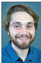
By MICHAEL NILES Contributor

Do you know if your household is at risk of flooding? While you may not think your home is at risk, floods can happen anywhere it rains or snows. Even in a low-risk area, being well prepared for a flood can prevent property damage and keep you and your loved ones safe.