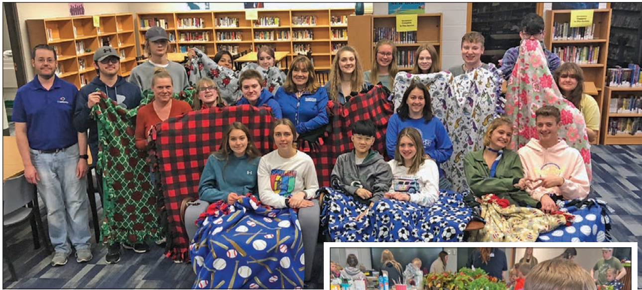
Parkview High School Students measured, cut and tied material to assemble 10 fleece blankets for donation to the Ronald McDonald House as part of their Day of Giving.