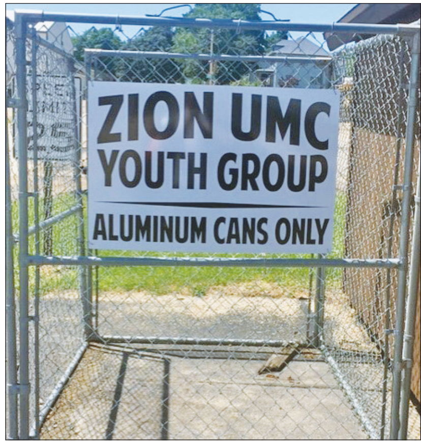
SUBMITTED PHOTO Brodhead Independent Register Zion and Oakley United Methodist Churches Youth Group's collection cage is in the Bank of New Glarus parking lot on Walnut Street in Juda.

purchase extra supplies for students. Pflingsten reminds the public that only empty aluminum cans can be accepted in this fund drive, and no empty cat food cans, please. "Thank you to everyone who has given cans to help support these worthy causes," Pflingsten said in a release on the youth group fund drive.