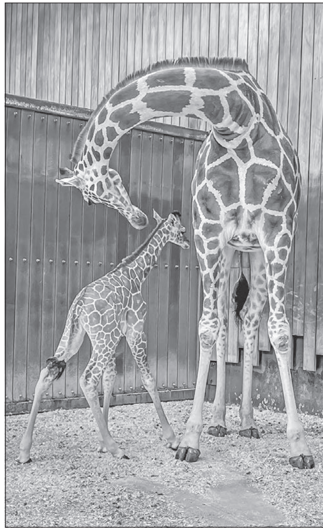
SUBMITTED PHOTOS Brodhead Independent Register