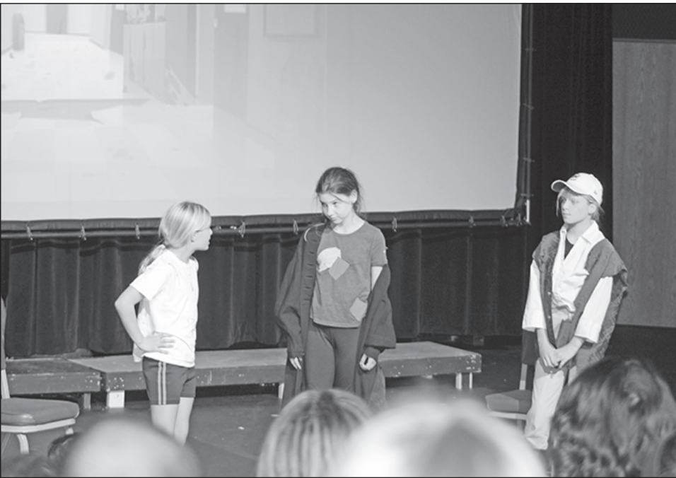
Trio draws audience into Reunion After the End of the World

Trio with excerpt from "Alice in Winter Wonderland."