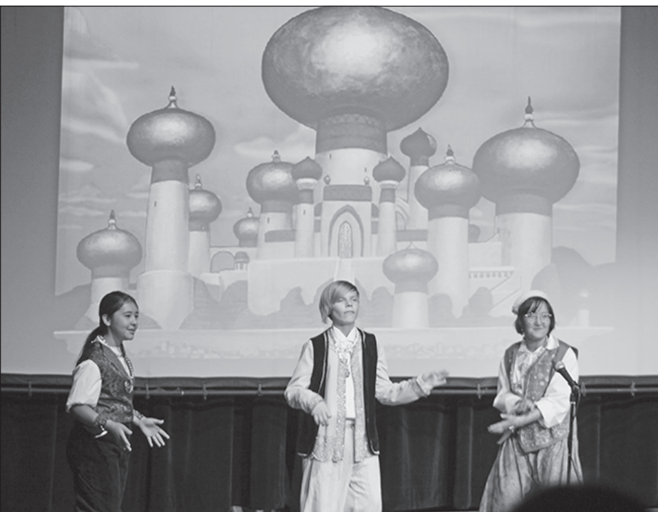
Song from "Prince Ali" during the 2022 Revue last week at Monroe Theatre Guild.