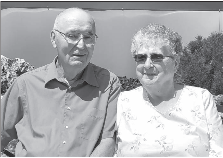
SUBMITTED PHOTO Brodhead Independent Register