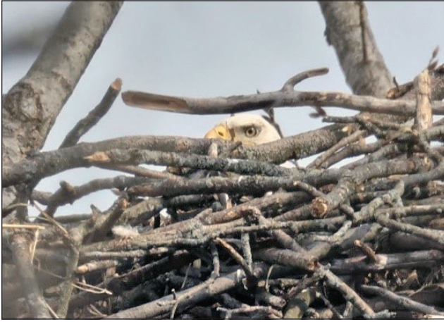
Brodhead Independent Register

The current Learn to Hunt and Learn to Fish program offerings, along with enrollment instructions, can be found on the DNR Events Calendar. The calendar will be updated as more programs become available.