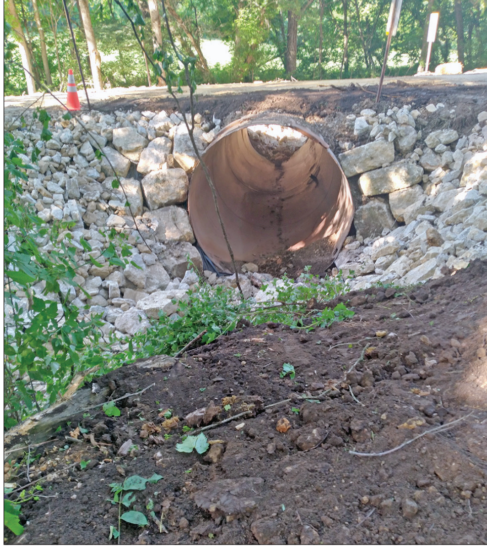
GREEN COUNTY PHOTO Brodhead Independent Register Green County has found a way to recycle old train car tankers, a quick and relatively inexpensive way to replace old highway bridges and structures.