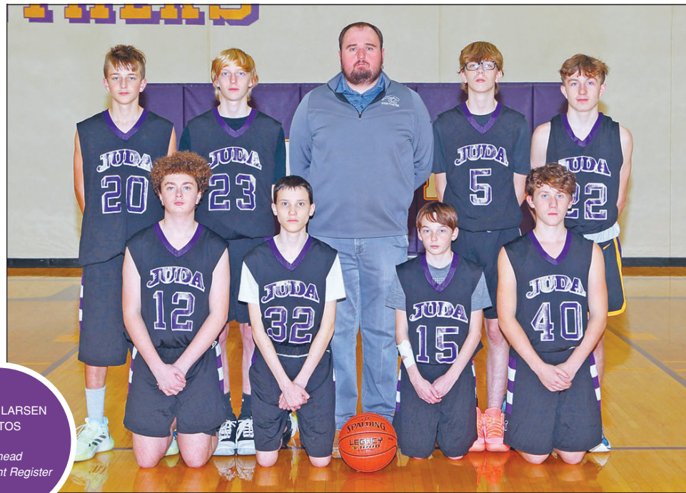
Junior Varsity Boys Basketball