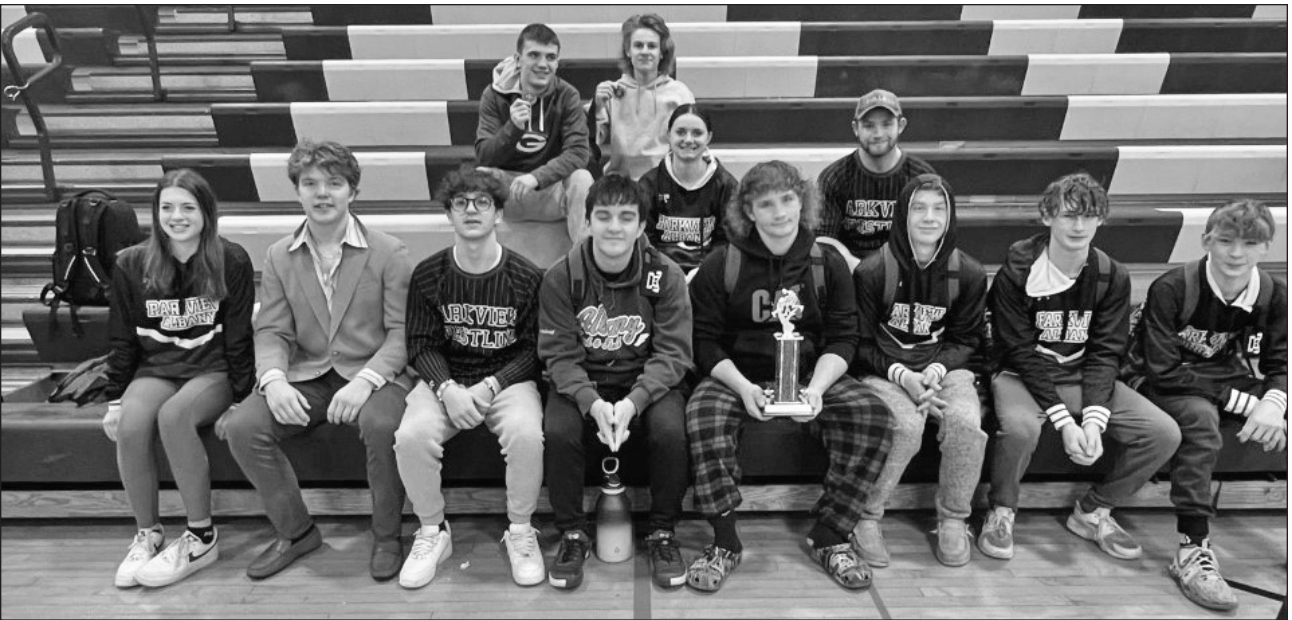
Parkview-Albany high school wrestling team display their 3rd place team finish with 153.5 points at Polo, Ill.

Great job again by the wrestlers and coaches.