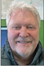
By CHRIS NARVESON Green County Highway Commissioner

We replaced two bridges for Green County, one town bridge, as well as three town