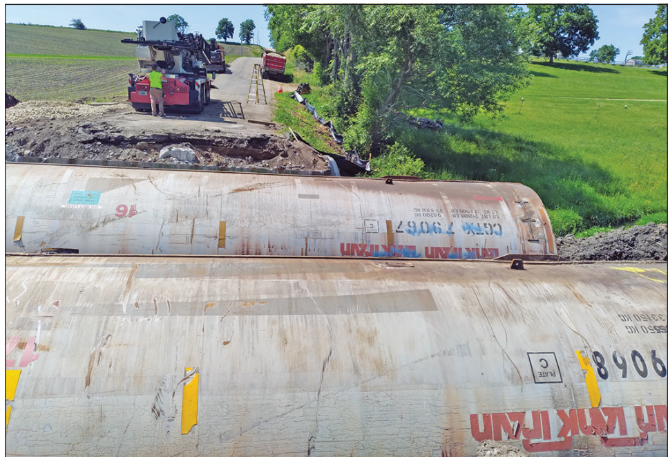
GREEN COUNTY PHOTO Brodhead Independent Register

Mail form along with payment to: Rock Valley Publishing / The Independent-Register, 917 W. Exchange St., Brodhead, WI 53520 Or call to subscribe: 608-897-2193