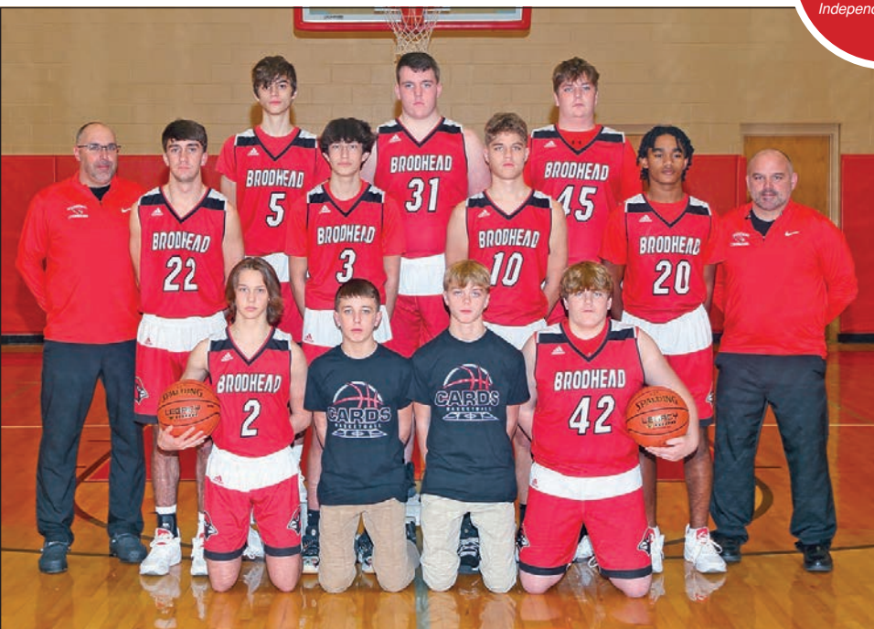
Junior Varsity 1 Boys Basketball