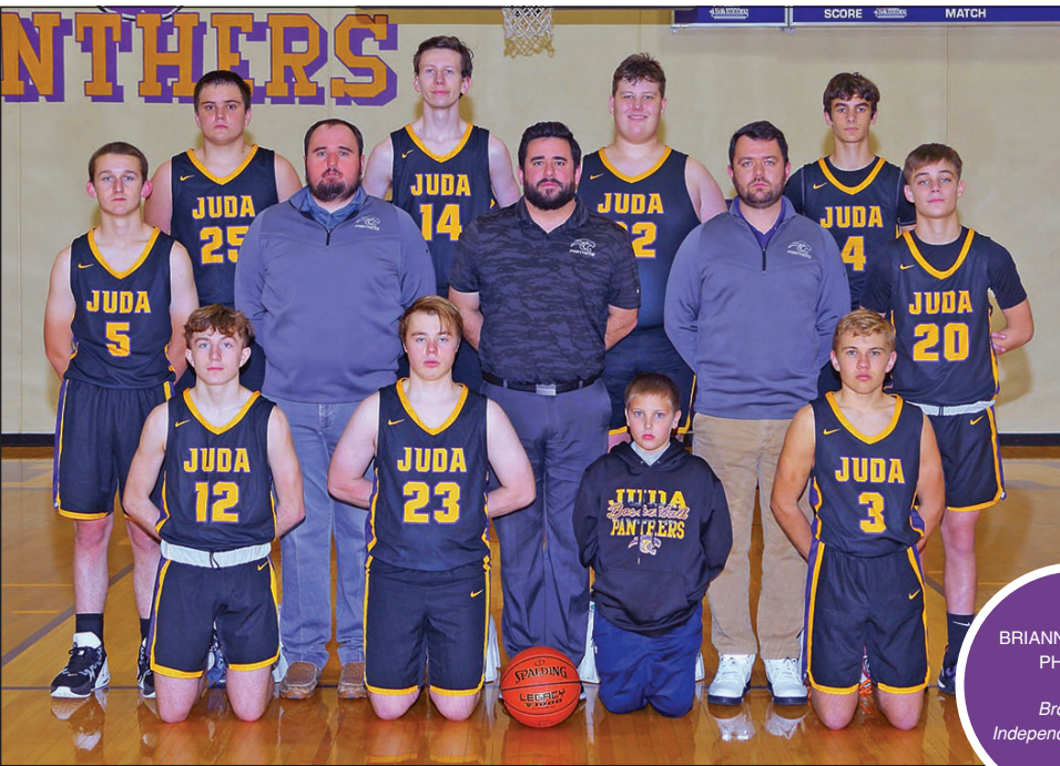
Varsity Boys Basketball