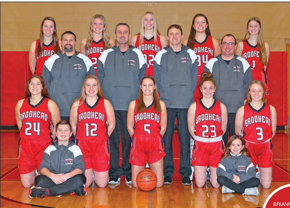
Varsity Girls Basketball