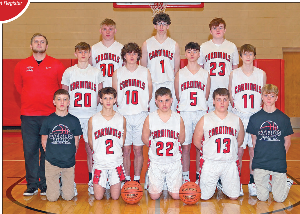
Junior Varsity 2 Boys Basketball