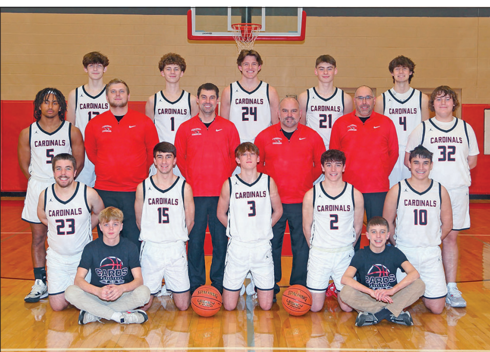
Varsity Boys Basketball