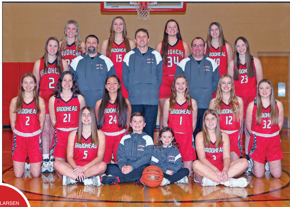
Junior Varsity Girls Basketball