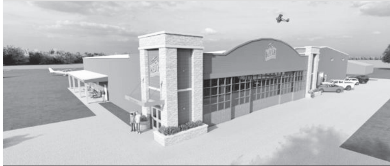
KELCH AVIATION PHOTO